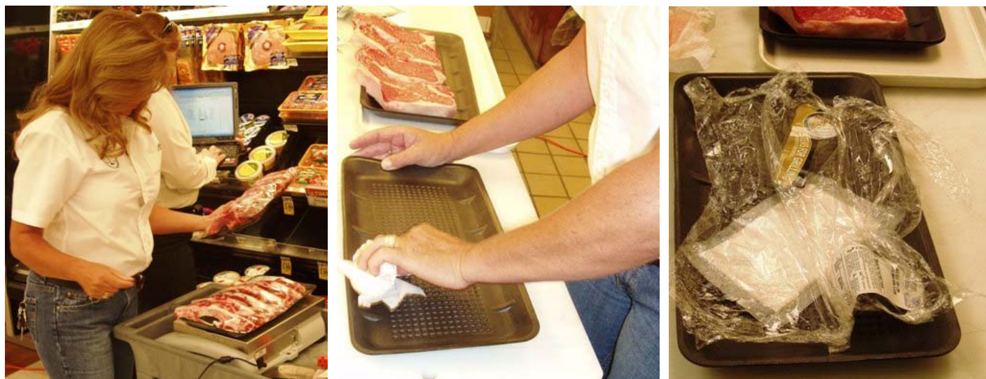
First the weight of each meat package is entered into a computer. Then the packaging is removed, cleaned and weighed.